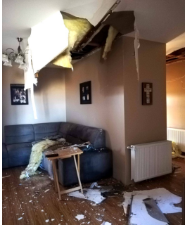
Our Living Room