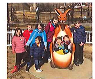
Home schooling group visited a zoo