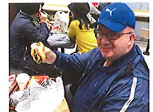
Ra-Men' s outing @Wendy' s