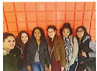
Ladie' s outing to Korean Town