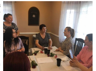
Mother & Daughter Banquet

We had a great time of fellowship at our Adult Valentine's Banquet with lots of Good food, desserts, games and a devotional from God's word with 9 in attendance. Also our Mother & Daughter Banquet was a great success with 12 attending. We enjoyed once again lots of Good food, laughs, games and a devotional on being a Light in the World.