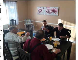
Men's Prayer Breakfast

We had our first men's prayer breakfast and Bible study in January with 4 in attendance. We had a wonderful breakfast prepared by my wife. The men totally enjoyed the egg casserole, hard boiled eggs, ham, cheese, yogurt, toast, orange juice. and coffee. It was a great time of fellowship and a blessing to get to know each one more personally. We then had a time of singing hymns, taking prayer requests and praying for each others requests. Our first Bible study lesson was about the origin of the Bible, who wrote the Bible, how many authors, books, divisions, and etc. For our next meeting we plan to study the canonization of the Bible and why certain books are in the Bible and the qualifications to be considered God's Word. The meeting seemed to be a success and was very well received. Please pray with us that it will grow and we can encourage other men to come, hear more about God's word, and have the opportunity to except Christ as their personal savior